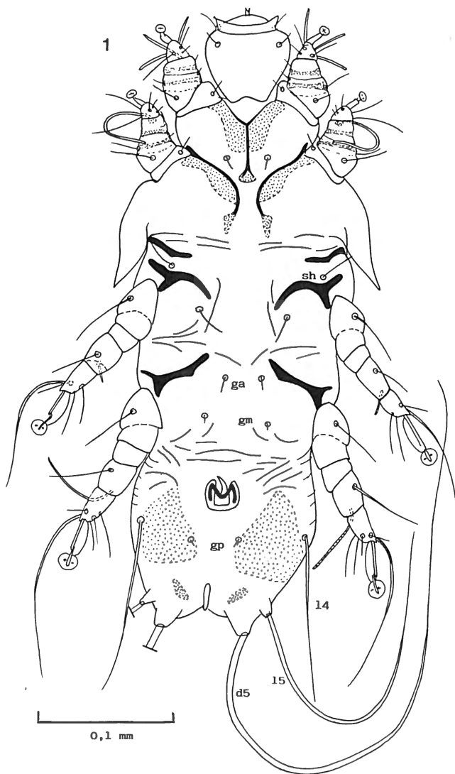
Fig. 1. Calamicoptes lomberti n. sp. Male in ventral view.

Our specimens could belong to one of the species which are known only by the female, however that seems very unlikely owing to the high specificity of these mites. The only one other species described from Galliformes is Calamicoptes galli LOMBERT et al. , 1984 represented only by female specimens collected from Gallus gallus domesticus from Morocco. These females differ from our specimens by the following characters: setae d2 present, setae gm lacking, d5 much longer.