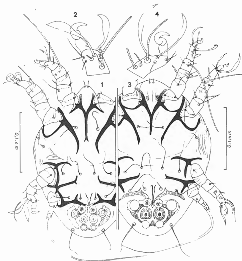
Fig. 1-4. — Fig. 1-2: Chaetodactylus ( Achaetodactylus ) ceratinae FAIN. Hypopus : 1. — Ventral view; 2. Tarsus I dorsally. Fig. 3-4: Chaetodactylus ( Achaetodactylus ) leleupi FAIN. Hypopus : 3. — Ventral view; 4. — Tarsus I dorsally.

Host and locality. — Holotype from Ceratina ruwenzorica ♀ from Karen, Nairobi, Kenya, 11.V.1967 (bee n° 222). From the same host and locality but from other bees n° 181, 182, 183, 185, 187, 188, 193, 195, 200, 217, 218, 219, 220, 222 (40 paratypes). The mites were fixed