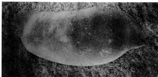
Fig. 2 — Palaeophilomedes neuwillensis CASIER, 1988. An example of Cypridinacea. Specimen discovered by T. BECKER, in the La Serre coupe C in the Montagne Noire, France. Collection University of Paris 6 n° P6M 1836. x16.5.

the Myodocopida, and, sharing the opinion of BECKER & BLESS (1987) that during the Devonian they lived in the same environments, we suggested it more appropriate to replace the “entomozoid ecotype” by a “myodocopid ecotype” (CASIER, et al. , 1985). This was an error of judgment. The recent study of ostracods present in the Neuville railway section (CASIER, 2003) has shown that on the contrary to entomozoaceans, cypridinoid ostracods were not affected during the Late Devonian mass extinction. Moreover, unlike entomozoaceans, cypridinoid ostracods are sometimes found in environments devoid of other ostracods and fossils. Consequently we suggest that not all cypridinaceans and entomozoaceans shared the same life strategy during the Devonian: entomozoaceans were nektobenthic and opportunists in poorly oxygenated environments, whereas all or a part of the cypridinaceans lived in an upper layer of water, maybe close to the surface. Consequently, and by definition, they were not members of the same ecotype, and the “entomozoid ecotype” of BECKER ( in BANDEL & BECKER, 1975) remains valid but not as emended by the same author in 2001 in order to include the cypridinaceans. In order to distinguish assemblages, a “Myodocopid Mega-Assemblage” characterized by the presence of entomozoaceans and (or) cypridinaceans (= Assemblage V of CASIER et al. , 1985; see also fig. 3 in CASIER & PRÉAT, 2003) is used in this case, rather than an ecotype, since this removes