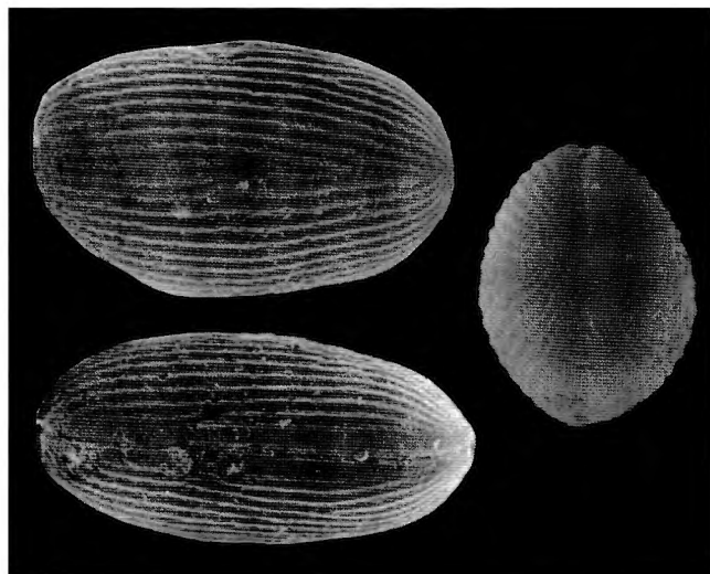
Fig. 1 — Richterina (Volkina) zimmermanni (VOLK, 1939). An example of streamlined entomozocean in lateral, dorsal and anterior view. Matagne Formation. Boussu-en-Fagne, Belgium. Collection IRScNB n° a1211. x50.

life habit for this group. On the contrary, the discovery of thick shelled silicified carapaces of entomozoceans led BLUMENSTENGEL (1965, 1973) to suggest that they were heavily calcified and consequently that they were benthic organisms. BECKER (1971) discovered a highly calcified carapace of entomozocean in the Belgian Frasnian, and also concluded that some entomozoceans displayed a benthic mode of life. KOZUR (1972) arrived to the conclusion that they were benthic psychrosphaeric ostracods.