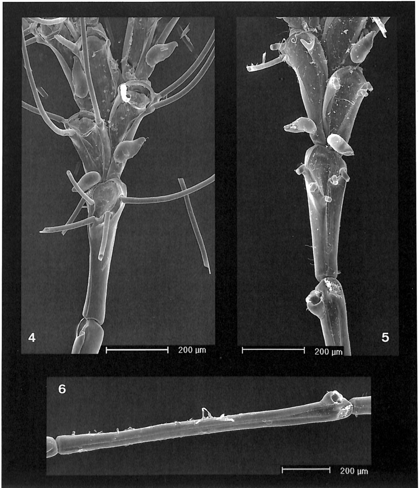
Plate 2 Fig 4. Pseudo-ancestrula and succeeding zooids (KBIN n° I.G.30297) Fig 5. Pseudo-ancestrula and first pair of succeeding zooids (KBIN n° I.G.30297) Fig 6. Stalk-kenozooid (KBIN n° I.G.30297)