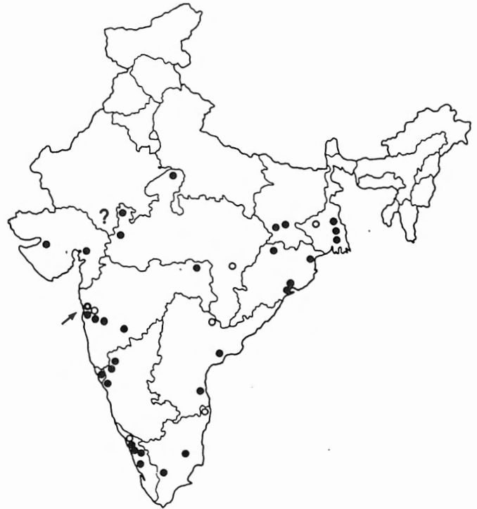
Fig. 1. – Distribution of Typhlops acutus in India. Open circles = specimens examined, solid circles = literature records, arrow points to type locality.

Snout pointed dorsally and hooked laterally with corneous horizontal transverse keel. Head not distinct from neck, body nearly uniform diameter throughout. Eye variable, usually a small dark spot lacking a pupil, a small eye with pupil present, or absent; in both lateral and dorsal view visible under all or most of postnasal. Total length 115–630 mm, total length/midbody diameter ratio 30–66. Tail about as broad as long, relative tail length 0.75–1.3 % (1.9 % reported in the literature but questionable), with a ventral concave curvature. Sexual dimorphism in caudal characters absent. Apical spine minute or absent, a small terminal knob-like scale