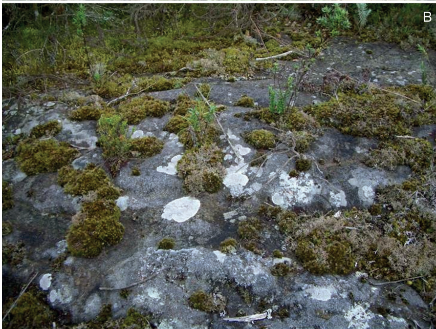
Fig. 5. A. Quartzitic rocks between Uwinka and Kamiranzovu, cushions of Scopelophila ligulata . B. Quartzitic rocks at summit of Mt. Bigugu with Campylopus sp.