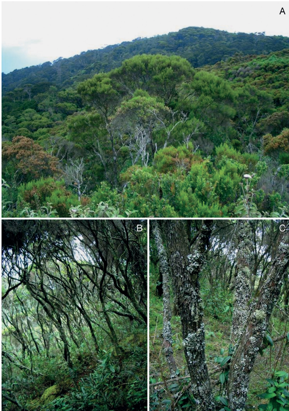
Fig. 6. A. Ericaceous shrub near summit of Mt. Bigugu, 2950 m. B-C. Ericaceous shrub at Rwasenkoko, 2400 m.