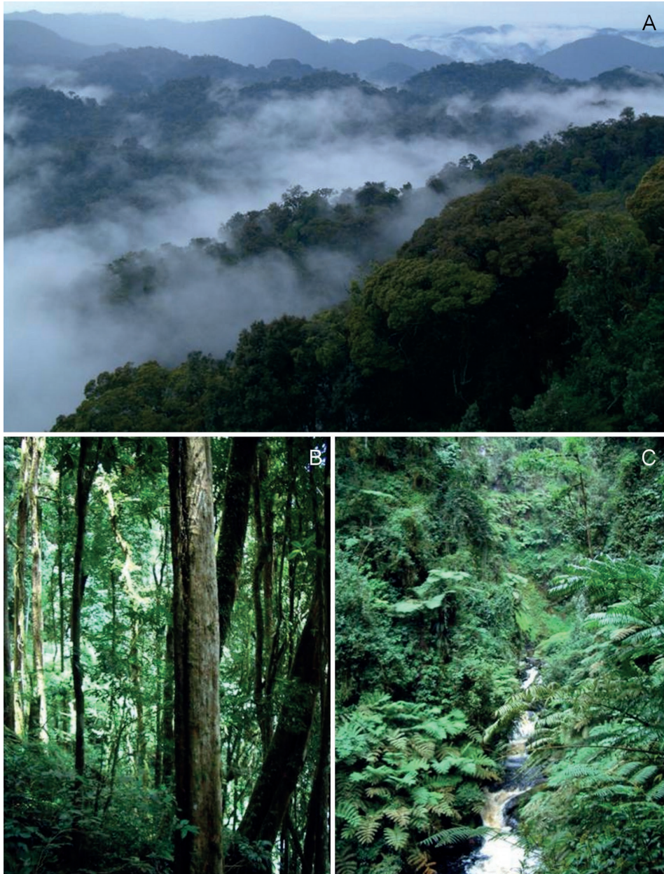
Fig. 2. Montane forest. A. Nyungwe National Park, Karamba. B-C. Gisakura, 1900 m.