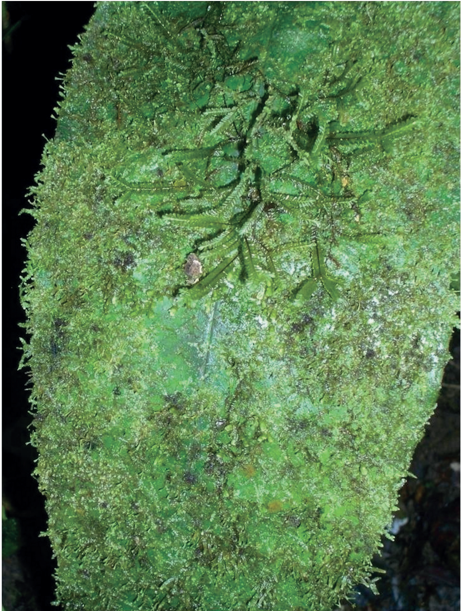
Fig. 3. Epiphyllous bryophytes. Nyungwe National Park, Kamiranzovu.