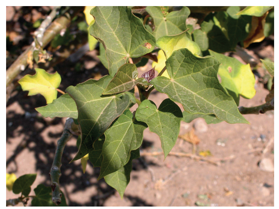
Fig. 302. Leaves of Jatropha curcas L.