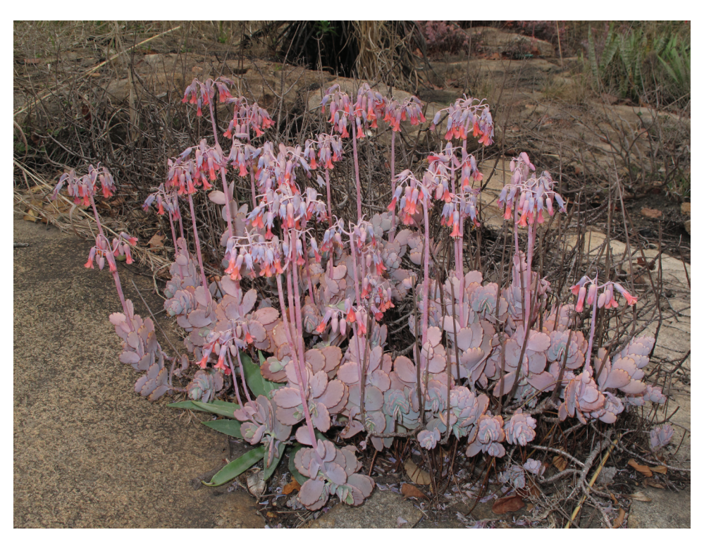
Fig. 288. Bryophyllum fedtschenkoi (Raym.-Hamet & H.Perrier) Lauz.-March.

Lavender scallops (Fig. 288, 289) is endemic to Central and southeastern Madagascar where it grows on siliceous rocks. It is widely encountered in cultivation and a variegated form with whitish-yellowish leaves is particularly popular (Descoings, 2003). It is naturalised in several countries (e.g. USA, India, Australia, Galapagos) where it most commonly spreads from waste places and gardens (Moran, 2009; PIER, 2010). In South Africa it is persistent and vegetatively spreading on the periphery of old homesteads (Fig. 290).