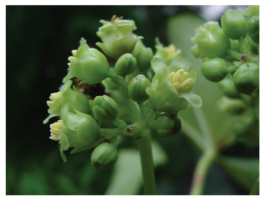
Fig. 303. Inflorescence of Jatropha curcas L.