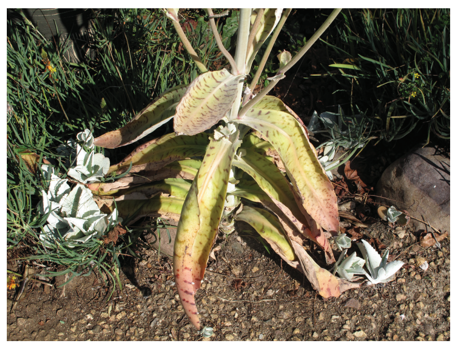
Fig. 292. Base of a plant of Bryophyllum gastonis-bonnieri (Raym.-Hamet & H.Perrier) Lauz.-March.