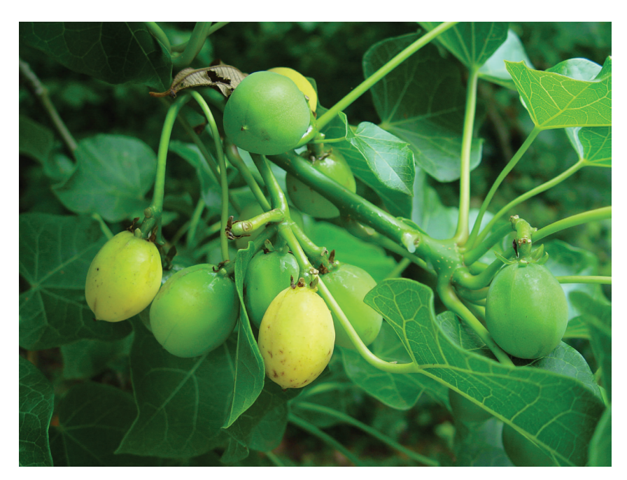
Fig. 304. Fruits of Jatropha curcas L.