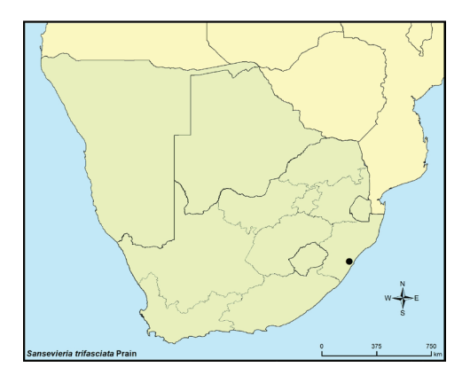
Fig. 297. Distribution map of Sansevieria trifasciata Prain.

southern Africa can be ascribed to the typical variety (Fig. 298). The var. laurentii differs from var. trifasciata in having yellow leaf margins up to 1 cm wide (Walker, 2001).