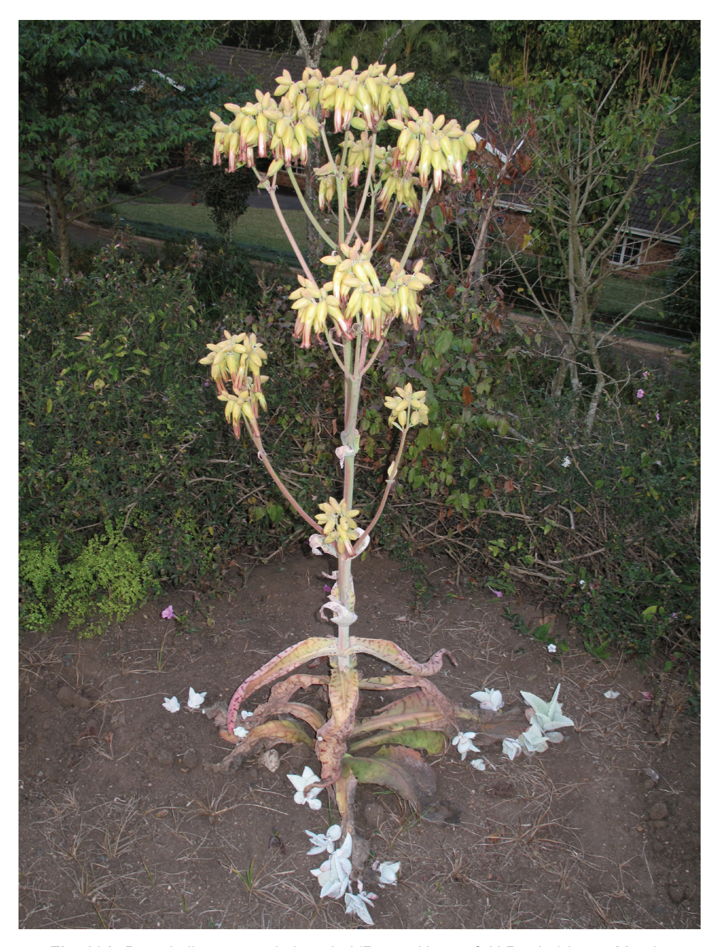
Fig. 291. Bryophyllum gastonis-bonnieri (Raym.-Hamet & H.Perrier) Lauz.-March.