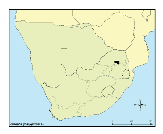
Fig. 306. Distribution map of Jatropha gossypiifolia L. var. elegans (Pohl) Müll.Arg.

Jatropha gossypiifolia (Fig. 307) is native to the West Indies, and Central and South America (Radcliffe-Smith, 1986). It was introduced into the Old World tropics where it was planted as a quick-growing hedge and boundary plant. It is also grown ornamentally for its striking dark red young foliage (Fig. 308). It is widely planted as an ornamental and medicinal plant in villages of the tropics (Kawanga, 2007). It escaped and became naturalised throughout tropical Africa, but only sporadically in northern South Africa.