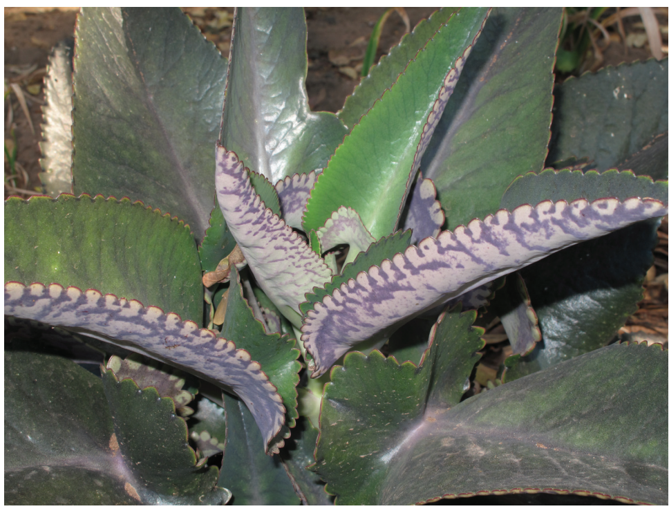
Fig. 287. Leaves of Bryophyllum daigremontianum (Raym.-Hamet & H.Perrier) A.Berger.