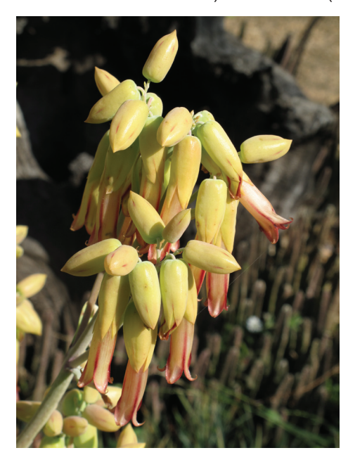
Fig. 293. Flowers of Bryophyllum gastonis-bonnieri (Raym.-Hamet & H.Perrier) Lauz.-March.