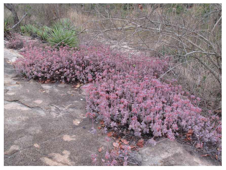
Fig. 290. Bryophyllum fedtschenkoi (Raym.-Hamet & H.Perrier) Lauz.-March. on the periphery of an old homestead.