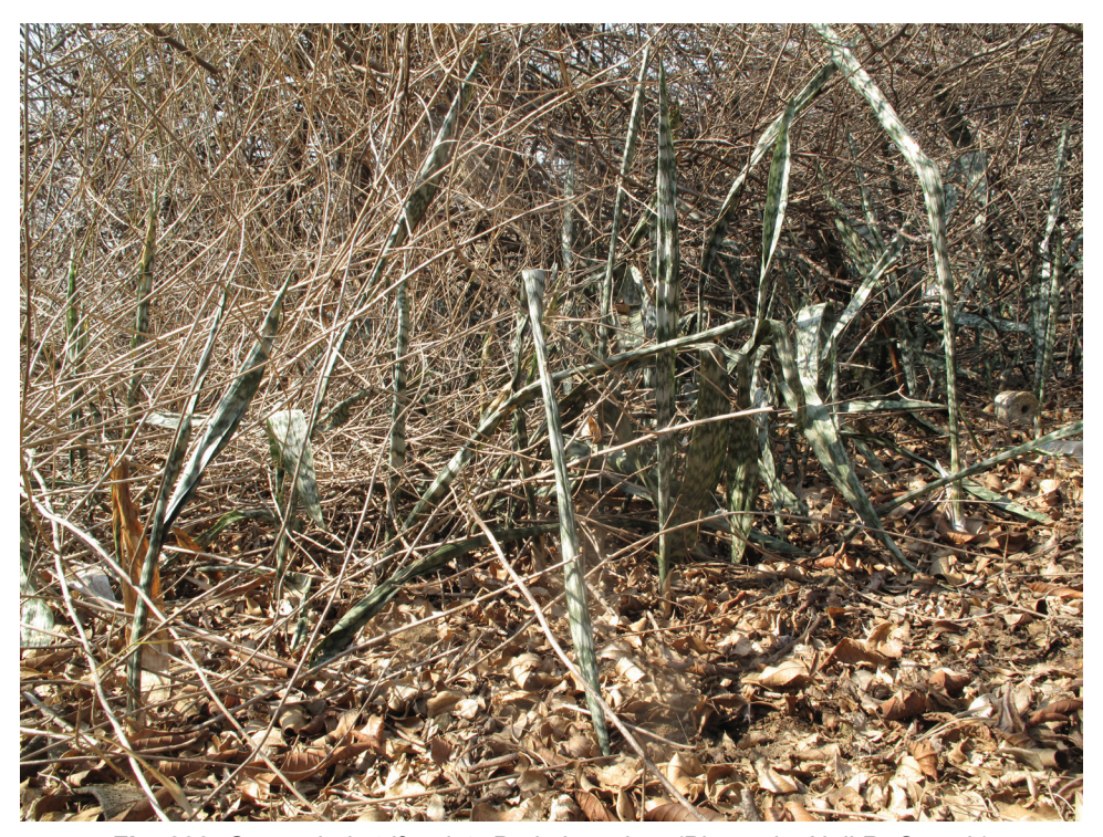
Fig. 299. Sansevieria trifasciata Prain invasion.

Sansevieria trifasciata is widely cultivated as both an indoor and outdoor plant, with numerous cultivars in existence. These may differ in their leaf sizes, degrees of variegation and shades of green (Walker, 2001). The leaves are known to contain haemolytic compounds and organic acids (Watt & Breyer-Brandwijk, 1962).