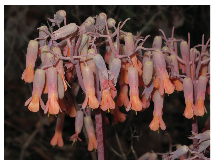
Fig. 289. Flowers of Bryophyllum fedtschenkoi (Raym.-Hamet & H.Perrier) Lauz.-March.