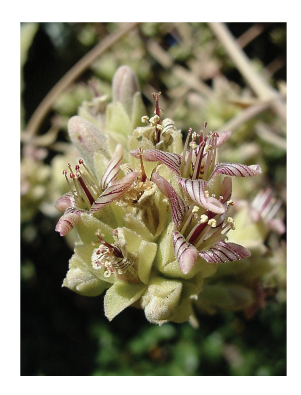
Fig. 295. Flowers of Kalanchoe beharensis Drake.