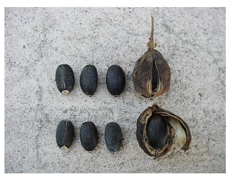
Fig. 305. Seeds of Jatropha curcas L.