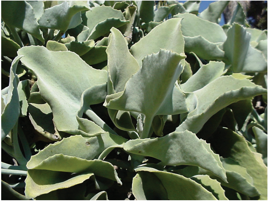
Fig. 296. Leaves of Kalanchoe beharensis Drake.