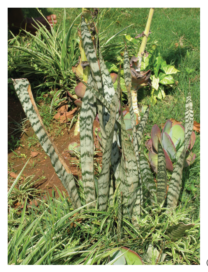
Fig. 298. Sansevieria trifasciata Prain in a healer garden.