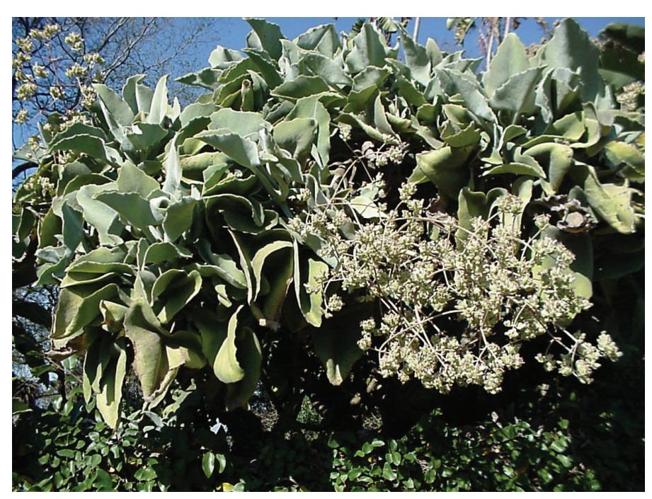
Fig. 294. Kalanchoe beharensis Drake.

Kalanchoe beharensis grows in four camps within the Kruger National Park in South Africa, where it has shown signs of naturalisation (Foxcroft et al. , 2008). It has potential as a garden escape, especially in subtropical parts of South Africa, due to its hardiness and prolific production of seedlings. Plants are frost-sensitive and will not easily survive the winter climates of South Africa above the Great Escarpment.