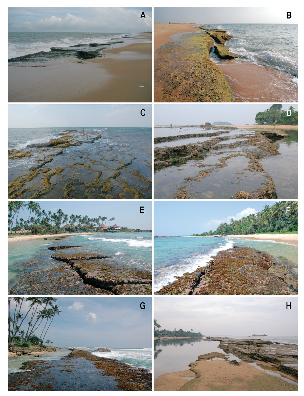
Fig. 4. Beachrock platforms. A. Extended beachrock platforms at about low tide level (Chilaw); B. Extended beachrock platforms breaking down, at the foot of a steep beach (Chilaw); C. Intertidal pools on the beachrock platform (Chilaw); D. Intertidal pools on the beachrock platform and lagoon (on the right hand side; Beruwela); E, F. Broken-up beachrock platform and small lagoon (next to Dickwella Resort peninsula); G. Beachrock platform and narrow lagoon (Koggala); H. Beachrock platform and broad lagoon (Beruwela).