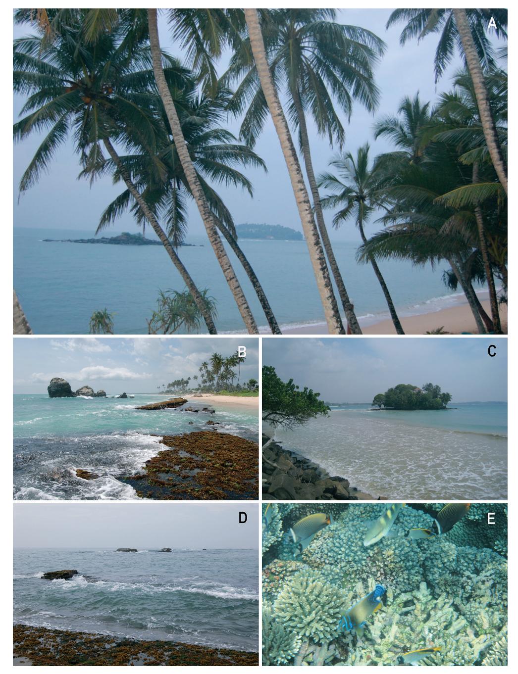
Fig. 7. Coast types. A. Coastal islands (Beruwela); B, D. Large rocky outcrops in the sea and coastal beachrock platform (B. Koggala; D. Beruwela); C. Coastal island in Weligama Bay; E. Healthy coral reef close to Kalpitiya (Bar Reef).