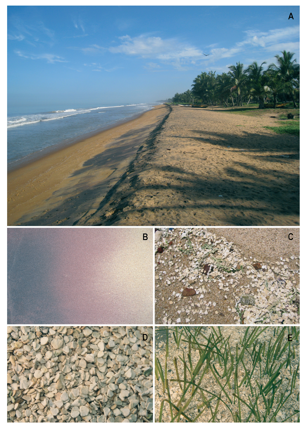
Fig. 2. Sandy beach and soft substrates. A. Sandy beach (Kalutara); B. Colourfull, finegrained sand of geological origin (Batheegama); C. Coarse coral sand, partly covered with some drift Halimeda gracilis plants and Halimeda sand (Weligama); D. Pure Halimeda -sand (Weligama); E. Seagrasses ( Cymodocea rotundata ) growing in Halimeda sand in a lagoon (Weligama).