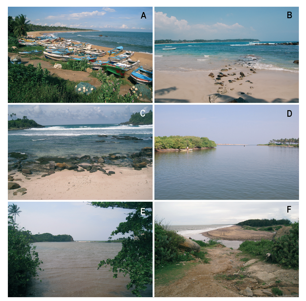
Fig. 3. Coast types. A. Sandy beach and a few rock outcrops in the sea (Hambantota);B. A wide bay (Dickwella); C. An enclosed bay (Nilwella); D. Chilaw lagoon; E. An estuary;F. Estuary, sandy beach and small dunes (Hambantota).

The major part of the West coast N of Colombo as well as of the E coast is composed of extensive sandy beaches (Fig. 3A), lagoons (Fig. 3D) and estuaries (Figs 3E, F). Along the sandy beaches, interrupted beachrock platforms can be present over long stretches, mostly parallel to the beach and close to low water mark (Fig. 4A). The landward margin of the visible part of these beachrock platforms is frequently covered by a thin layer of sand, evolving in a mostly rather steep beach (Fig. 4B). Some of the beachrock platforms are provided with numerous rock pools (Figs 4C, D). Locally a narrow, shallow lagoon can be present between the platform and the beach (Figs 4E-H). The seaward side of the platforms, generally abruptly ends with small vertical cliffs (0.5-2 m high), split up by crevices (Figs 5A, B). They are exposed to severe surf, forming a habitat with surf-resistant species (Fig. 5C).