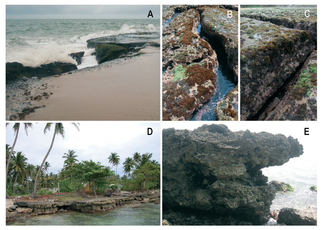
Fig. 5. Coast types. A-C. Broken-up beachrock platform with vertical walls covered by a typical surf-resistant seaweed vegetation (A, B. Chilaw; C. Hikkaduwa); D. Small cliff wall as the result of the erosion of a fossil reef (Polhena Beach, Matara); remark: the effects of the 2004 tsunami are still visible on land; E. Detail of a small eroded cliff wall of a fossil reef (Polhena Beach, Matara).

The southern coastline is characterized by the alternation of rocky coasts (Fig. 6A), rocky peninsulas (Fig. 6B), rock boulder areas (Fig. 6C) and wide or narrow sandy bays (Figs 3B, C; 6D, E). Some coast stretches are composed of small cliffs of eroded fossil coral (Figs 5D, E). A few places (Weligama, Hambantota/Usangoda) are characterized by short but high cliff walls (Figs 6F, G). Coastal dunes are rare, but if present they can be well-developed as in parts of Yala Park (Fig. 6H). Small islands (Figs 7A, B) or protruding rock boulders (Figs 7C, D) are scattered along the coast.