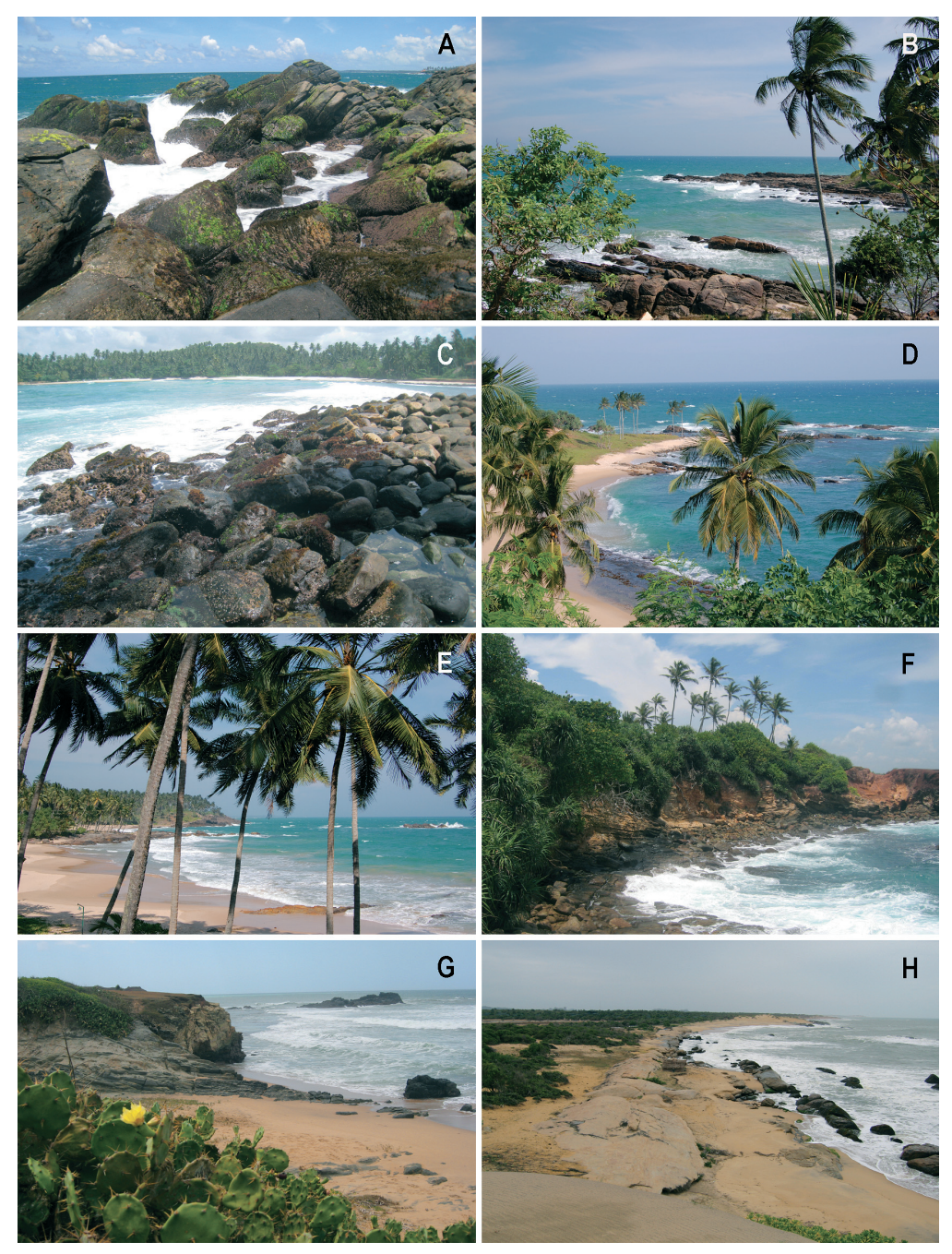
Fig. 6. Coast types. A. Rocky coast during the SW-monsoon (Dickwella); B. Surf-exposed peninsula (Tangalle); C. Rock boulders with a dense seaweed vegetation and marked zonation (Nilwella); D, E. Rocky peninsulas alternating with sandy bays fringed by beachrock platforms (Tangalle); F. Cliffs at Weligama;

G. Cliffs alternating with sandy beaches (Usangoda protected area, Hambantota); H. Dunes alternating with beachrock and intertidal rocks (Yala).