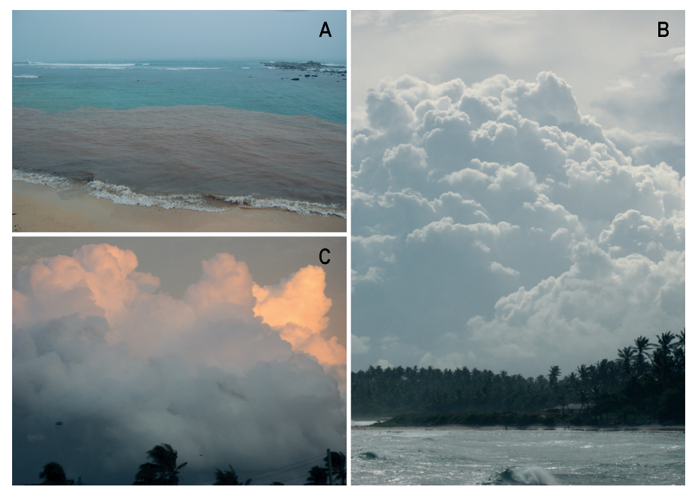
Fig. 8. Thunderstorms and effect on coastal water turbidity. A. Turbid coastal water after heavy rains (Unawatuna); B, C. Late afternoon thunderstorms arriving during the SW-monsoon (Dickwella).