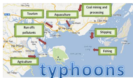
Figure 4: Topics for management of Halong Bay.