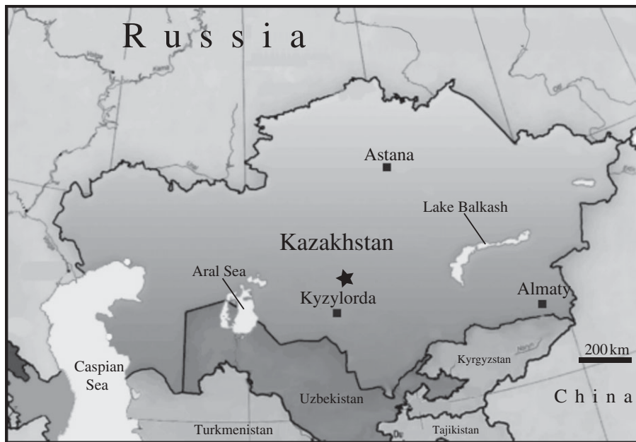
Figure 2. Map of the Republic of Kazakhstan showing the location of Akkurgan (star). Sites in southern Kazakhstan well known for yielding Cretaceous terrestrial vertebrates include the nearby Shakh-Shakh ( ca 200 km from Akkurgan) and the more southerly Kyrk-Kuduk and Syuk-Syuk. See Malakhov et al. [7] for more details.

the results indicate that Samrukia is nested deeply within Aves at the base of Ornithuromorpha ( sensu Chiappe & Witmer [9]), unresolved alongside Patagopteryx , Ichthyornis , Archaeorhynchus , the Yixianornis + Yanornis clade, Hongshanornithidae and Neornithes (figure 1). A series of derived characters, revealed by our analysis (i.e. two distinct mandibular cotyles, fusion of mandibular elements and absence of mandibular fenestrae) place Samrukia deep within Aves (figure 1) [9,10] and suggest that this taxon is not closely related to any of the modern bird lineages that evolved large size during the Cenozoic. All other known taxa within this region of the tree are relatively small (body size <2 kg and with mandibles ca 100 mm long or less) [3,9,21].