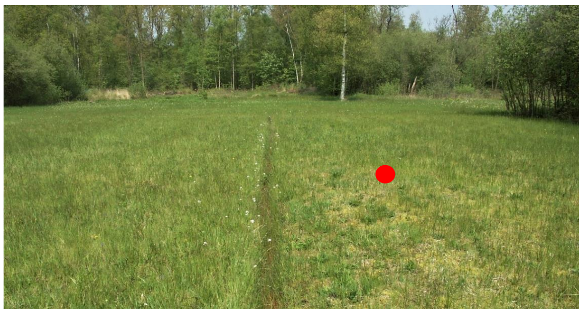
Fig. 1. Molinia grassland in early spring where M. karavajevi was found at nature reserve Vorsdonkbos-Turfputten (Aarschot, Belgium). Pitfall trap VOTU1 (indicated by a red circle) was placed a few meters to the right of the central ditch.

grassland and transition mire. On both locations, two glass jars were dug in the soil and filled for two thirds with a 4% formaldehyde solution. Water surface tension was broken with a few drops of detergent. A small cage consisting of an iron grate and a plexiglass cover was placed over the trap for protection and to avoid catching small vertebrates. The traps were installed on 30-03-2018 and removed on 27-10-2018. They were emptied more or less every 3 weeks. The pitfalls were both placed near an existing piëzometer, VOTP001B and VOTP020A respectively ( www.watina.inbo.be ). In addition, a vegetation survey was made at each location in a 4×2 m plot using the semi-quantitative Londo scale (LONDO, 1976). The most dominant plants in the VOTU1 vegetation survey plot were Succisa pratensis Moench (1794) and Equisetum palustre L. (1753), followed by Juncus articulatus L. (1753), Potentilla erecta (L.) Raeusch. (1797) and Luzula multiflora (Retz.) Lej. (1811).