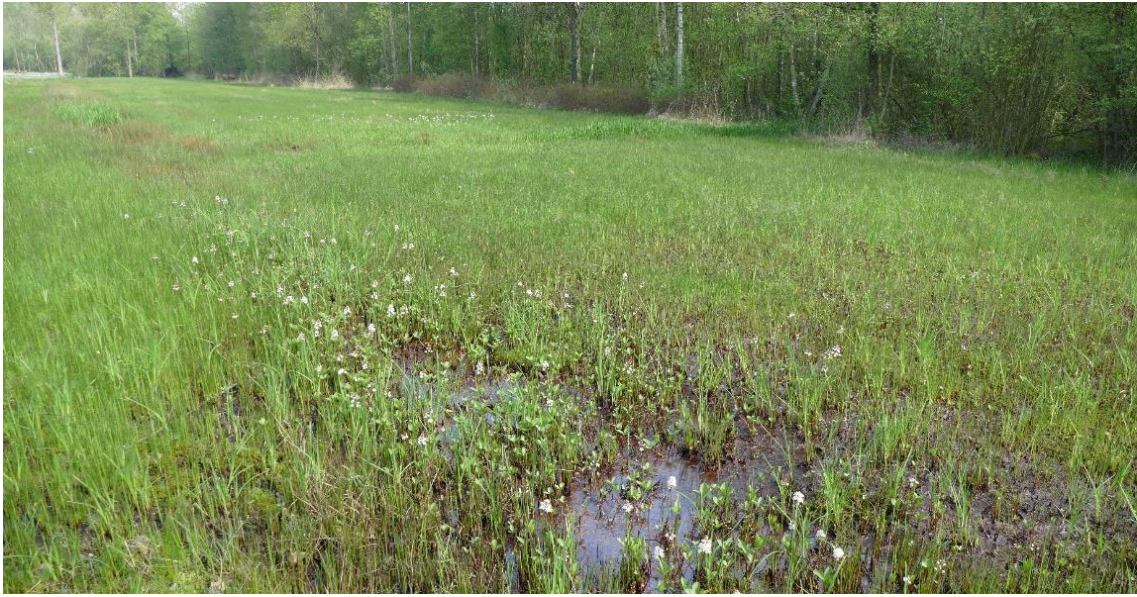
Fig. 2. Transition mire with flowering Menyanthes trifoliata in early spring where M. karavajevi was found, nature reserve Vorsdonkbos-Turfputten (Aarschot, Belgium). The exact location is left of the picture at a slightly elevated site near a solitary oak tree.