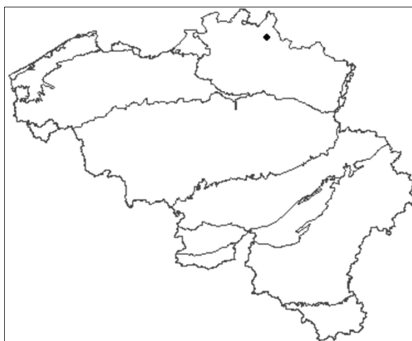
Fig. 2. Localities where Choerades ignea has been found in Belgium.

Choerades ignea is present in large parts of Europe and Asia. WOLFF et al. (2018) lists Austria, Czech Republic, Germany, Spain, France,