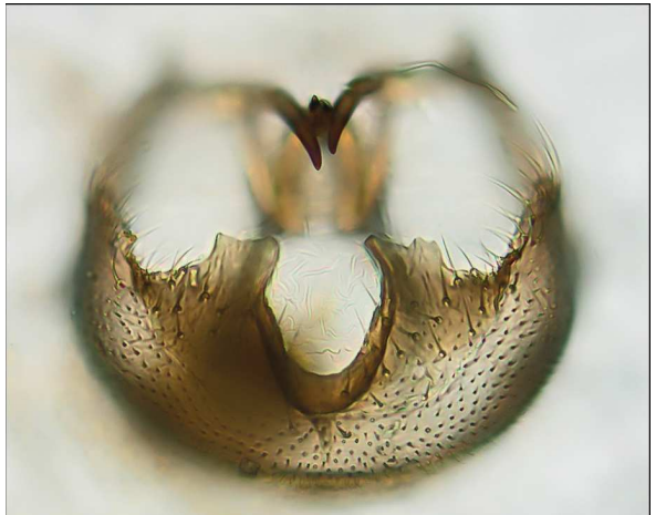
Fig. 3. Ventral view of the hypandrium of Coniopteryx (Coniopteryx) hoelzeli 7H. Aspöck, 1964.