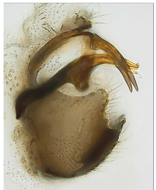
Fig. 1. Lateral view of the male genitalia of Coniopteryx ( Coniopteryx ) hoelzeli H. Aspöck, 1964.