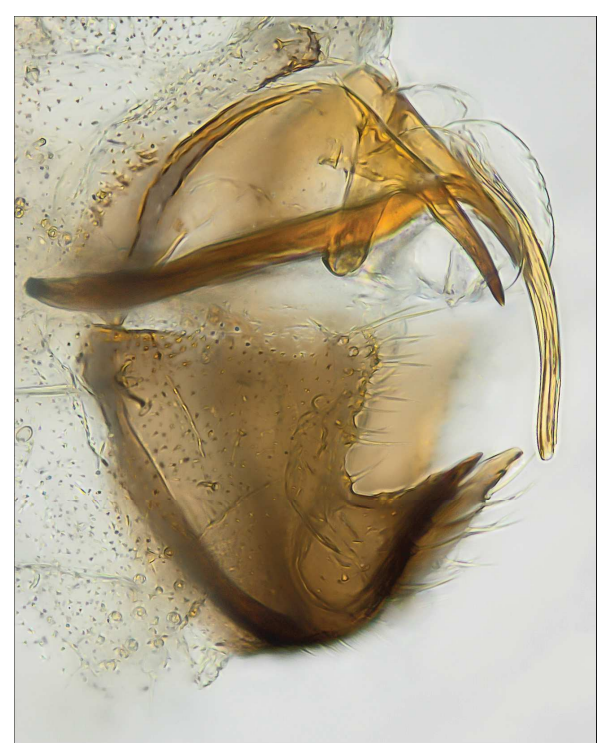
Fig. 2. Lateral view of the male genitalia of Coniopteryx (Coniopteryx) pygmaea Enderlein, 1906.