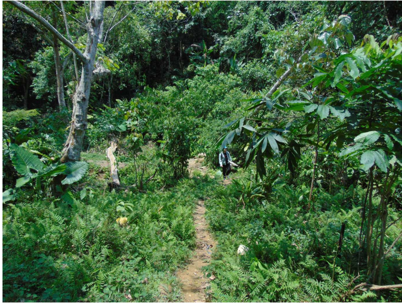
Fig. 2. Habitat of Sphinctogonia lacta Zhang & Kuoh, 1993 in Cham Chu Nature Reserve, Vietnam.