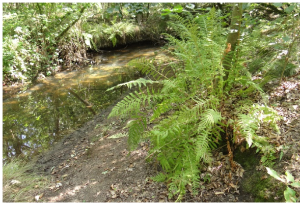
Fig. 4. Typical habitat where mines were found; Hamont-Achel, Warmbeek (Belgium), 12.VIII.2018.