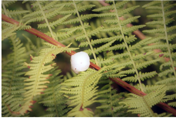
Fig. 2. Foam structure on A. filix-femina ; Willerzie (Belgium), 23.VII.2018.