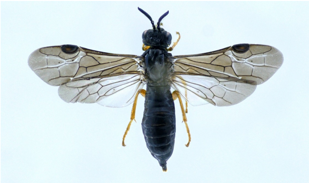
Fig. 1. B. filiceti ♀, coll. Ad Mol; Boxtel, De Geelders (Netherlands), 14.V.2018.

The adults are predominantly active in May and June. They are coloured mainly black with yellowish femora, tibiae and tarsi, and venter. Their wings are slightly infuscate with piceous stigma and venation (Fig. 1.). The total length is about 8 mm (BENSON, 1951). Moreover, as records in Europe show until now, all caught adults are females. This indeed strongly suggests parthenogenetic reproduction. At the end of June and the beginning of July, females start laying their eggs on ferns. Host plants reported with certainty in Europe are Dryopteris filix-mas (L.) Schott, 1834, D. carthusiana (Vill.) Fuchs, 1959, Athyrium distentifolium Tausch ex Opiz and Matteuccia struthiopteris (L.) Tod, but above all Athyrium filix-femina (L.) Roth is preferred (LISTON, 2007). The habitat and biotope seem to differ greatly, from coniferous forests in the eastern parts of Europe (NOVGORODOVA & BIRYUKOVA, 2011a) to wetlands and/or bog vegetation with peat, or even horticultural gardens (see below) in the more western parts of Europe (e.g. KEY, 1998).