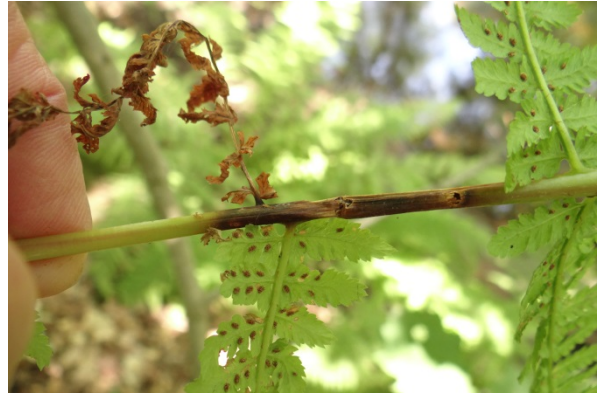
Fig. 3. Blackened rachis of Athyrium filix-femina with mines (and holes); Hamont-Achel, Warmbeek (Belgium), 12.VIII.2018.