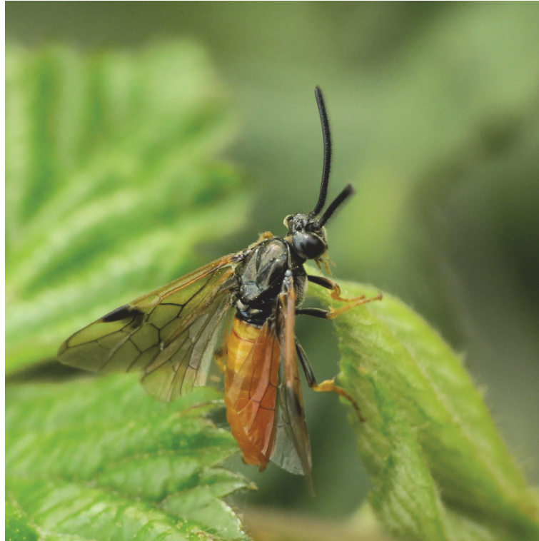
Fig. 1. Adult of Arge dimidiata (Fallén, 1808) from Holten, The Netherlands (leg. J. Wessels, 01.VI.2015).