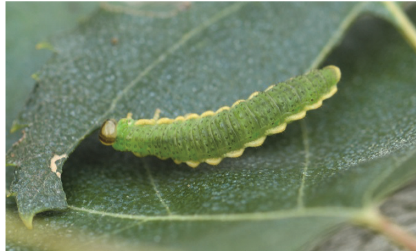
Fig. 4. Larva of Arge dimidiata from Overpelt, Belgium (leg. G. Van Hertum, 22.VIII.2017).