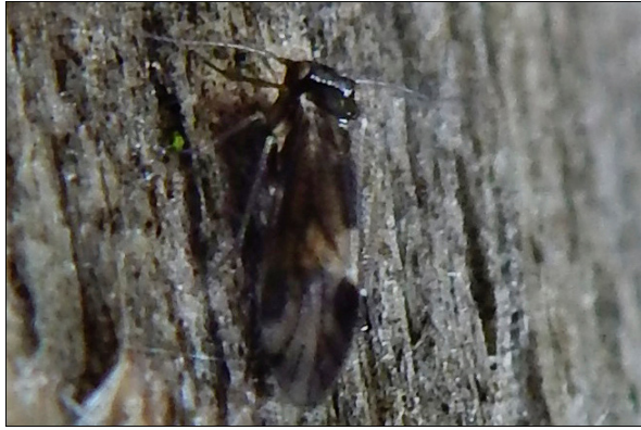
Fig. 1. Habitus of Trimerocaecilius becheti Meinander, 1978.