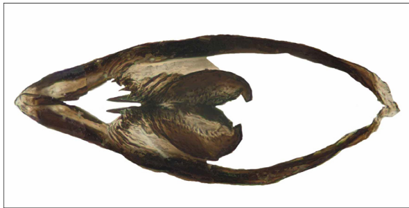
Fig. 3. Dorsal view of phallosome Trimerocaecilius becheti Meinander, 1978 (Photo: Koen Lock).