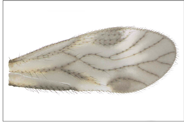
Fig. 2. Right forewing of Trimerocaecilius becheti Meinander, 1978.