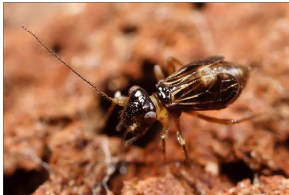
Fig. 3. Ectopsocus axillaris (Smithers, 1969).

Ectopsocidae do not possess an areola postica in the forewings, but unlike Peripsocidae, the vertex is pilose. In Belgium, they are only represented by the genus Ectopsocus . Both Ectopsocus petersi Smithers, 1978 and Ectopsocus briggsi McLachlan, 1899 have been introduced in Belgium. Ectopsocus briggsi was first observed in 1919 (BALL, 1920a,b) and E. petersi in 1983 (SCHNEIDER, 1989), but they are now among the most common Psocoptera in natural habitats.