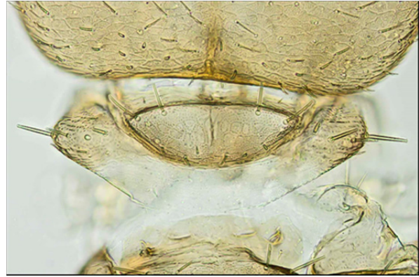
Fig. 2. Pronotum of Liposcelis palatina Roesler, 1953.