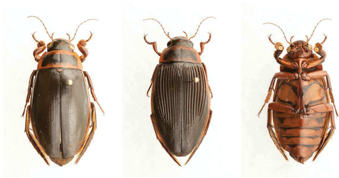
Fig. 1. Dytiscus lapponicus Gyllenhal, 1808. From left to right: dorsal view male, dorsal view female and ventral view male (collection K. Scheers).

On the ninth of June 2015 a trap, of the type 'Molchreuse', was placed in each of the five surveyed ponds in the nature reserve Ophovenerheide. These traps were baited with cat-food (14% beef and 4% liver) and left over night. In two of the traps Dytiscus lapponicus was caught with respectively one and six specimens. In the traps with D. lapponicus no other Dytiscidae were present. The other traps contained common species of water beetles: Dytiscus marginalis Linnaeus, 1758, Acilius sulcatus (Linnaeus, 1758), Acilius canaliculatus (Nicolai, 1822) and Colymbetes fuscus (Linnaeus, 1758). The trap at the Zwartven, where six specimens of D. lapponicus were present, was the only location where the exotic fish Umbra pygmaea (DeKay, 1842) was absent.