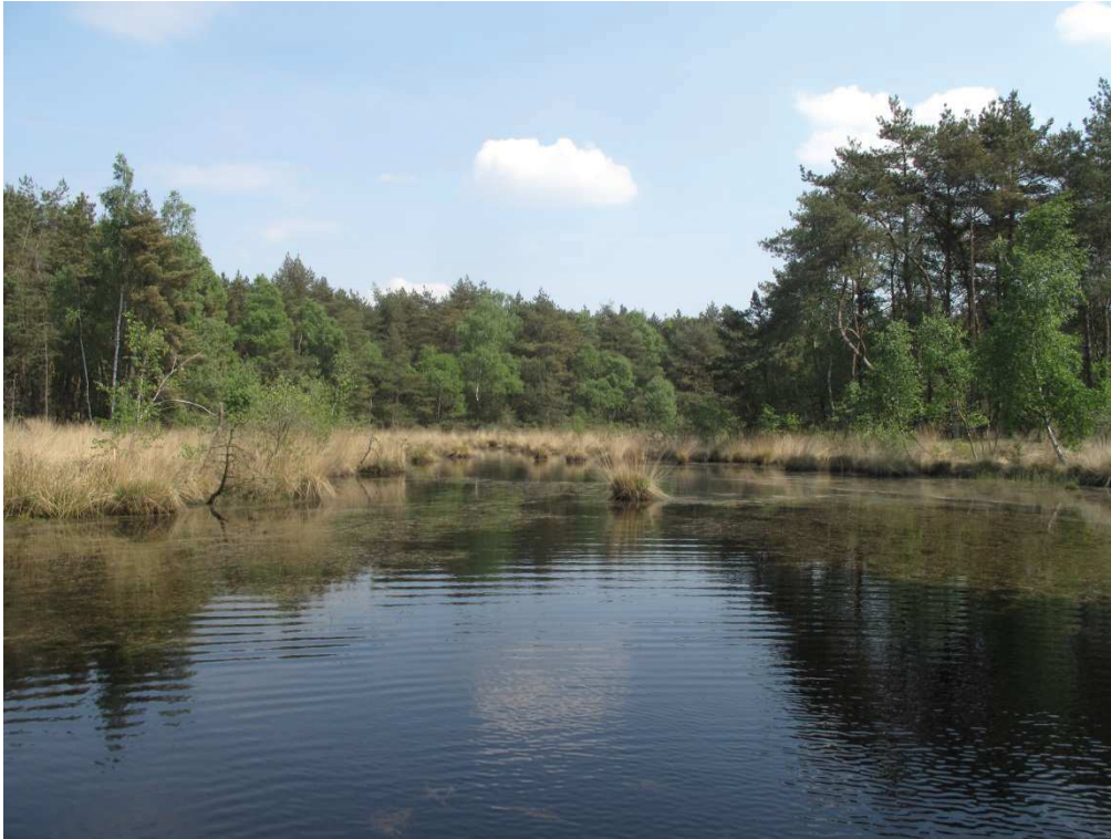
Fig. 3. Turfven II in the nature reserve Ophovenerheide. In this rather small oligotrophic lake with Sphagnum cuspidatum and Juncus bulbosus one specimen of Dytiscus lapponicus Gyllenhal, 1808 was caught in a baited trap.