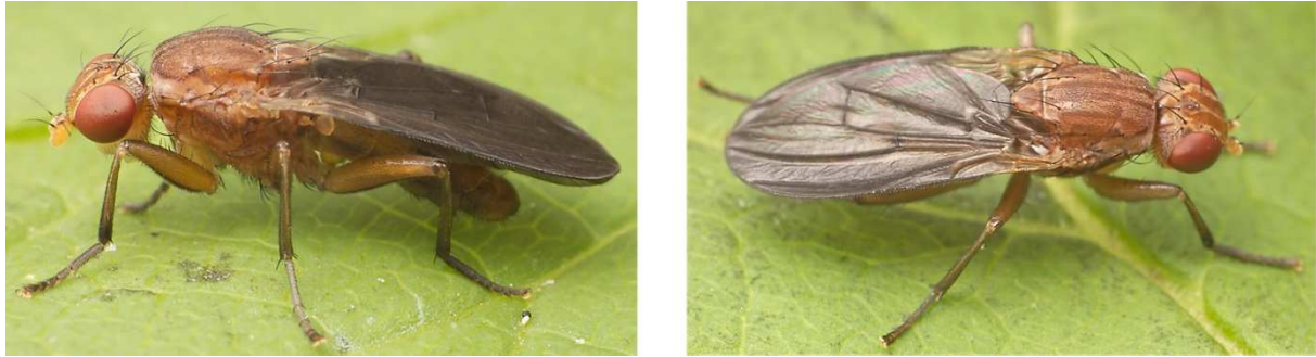
Fig 1. Pelidnoptera fuscipennis.