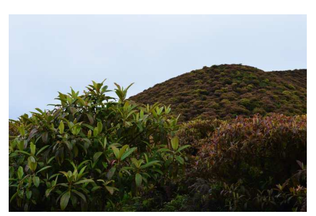
Fig. 1. Miconia forest at Media Luna.

During a 10-day course (19.XI.2012 – 28.XI.2012) on ant taxonomy and ecology in the Galápagos Archipelago, ants were collected in the field by four instructors and eight students (including three Ecuadorian students who had attended the previous ant course in Ecuador (DELSINNE & DEKONINCK, 2011), two Galápagos National Park (GNP) rangers and three students in Entomology at the Charles Darwin Research Station). Ten sites (Table 1) were grouped into four categories of habitats based on humidity and disturbance (VON AESCH & CHERIX, 2005; WAUTERS et al. ,