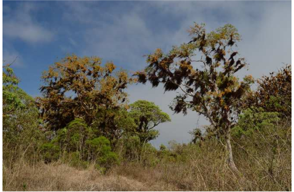
Fig. 4. Transition zone: Mina de Granillo Rojo