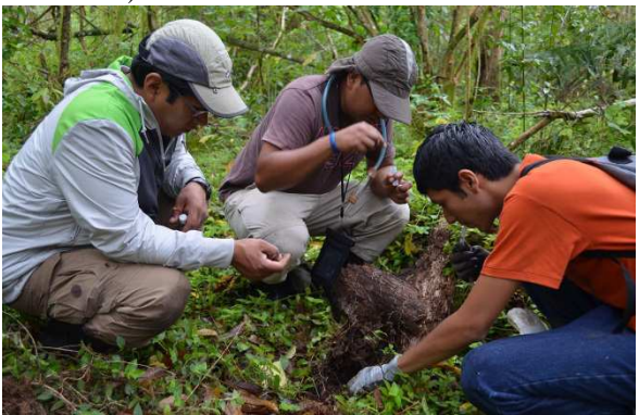
Fig. 5. Collecting ants by visual searching and hand sampling at El Chato

Table 1 Overview of the sampled sites with information on vegetation type, elevation and disturbance level; with ND=natural dry habitat, NH=natural humid habitat, DD=disturbed dry habitat and DD=disturbed humid.