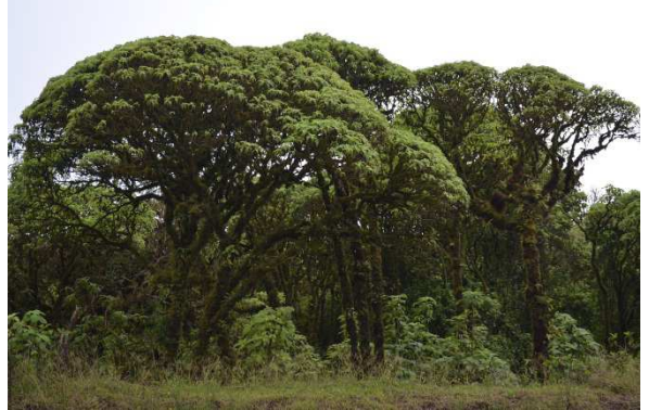
Fig. 2. Scalesia forest at Los Gemelos

For some taxa, identification at the species level using only morphological characteristics was impossible so far ( Nylanderia sp. and Pheidole sp.). These genera await taxonomical revisions of combined morphological and genetic data.