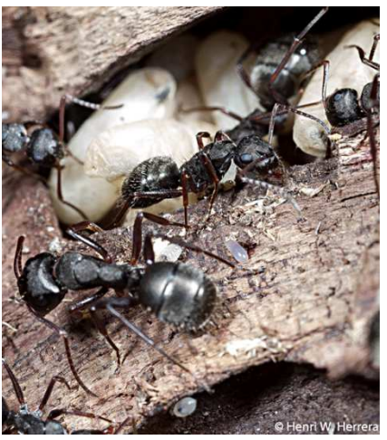
Fig. 6. Workers of the endemic species Camponotus planus

In total 22 species were collected (Table 2). Camponotus planus (Fig. 6) was the only certain endemic species collected out of seven known endemics to the islands (HERRERA, 2014; HERRERA et al. , 2014). We collected three species of which their status is unknown or incertain so far: Solenopsis gnoma (only at Mina de Granillo Rojo), Pheidole sp. (Media Luna and Mina de Granillo Rojo) and Nylanderia sp. (found at Los Gemelos and Media Luna). All other species have been introduced into Galápagos. Solenopsis geminata was collected at 8 sites, Brachymyrmex heeri at 7 sites (Table 2). The highest ant species richness was found at Los Gemelos (16 species) and at Mina de Granillo Rojo (15 species).