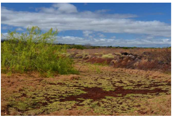
Fig. 3. Arid habitat at Sendero Playa Negra