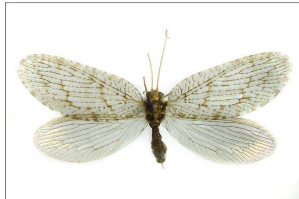
Fig. 5. Habitus of Wesmaelius ( Wesmaelius ) quadrifasciatus (Reuter 1894) (Hemerobiidae).

Some of the specimens identified as Wesmaelius ( Wesmaelius ) concinus (Stephens, 1836) turned out to be Wesmaelius ( Wesmaelius ) quadrifasciatus (Reuter, 1894) (Fig. 5). The latter species can be recognised by a dark brown thorax with a pale dorsal stripe, whereas W. concinus has a unicolorous pale thorax. In addition, the fore wings of W. quadrifasciatus bear numerous dark spots, whereas only a few dark spots are present in the fore wings of W. concinus . The longitudinal veins of the fore wing of W. quadrifasciatus bear dark streaks, the length of most of these streaks being far in excess of twice the width of the vein on which they are situated. In W. concinus , the longitudinal veins in the fore wing bear dark spots, the length of these spots being only around 1.5 to 2 times the width of the vein on which they are situated. W. quadrifasciatus has so far only been captured in the nineteenth century by DE SELYS-LONGCHAMPS in Halloy and Esneux.