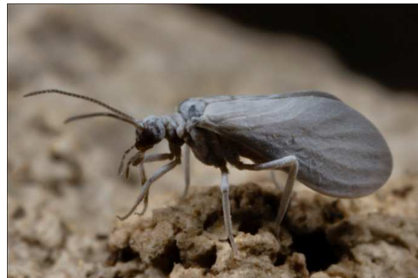
Fig. 2. Habitus of Semidalis cf. pseudouncinata Meinander 1963 (Coniopterygidae).