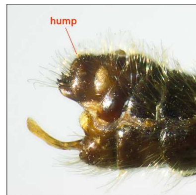
Fig. 3. Lateral view of the abdominal tip of a male Megalomus tortricoides Rambur 1842 (Hemerobiidae), with indication of the hump on the ectoproct (photograph by Koen LOCK).

All material that had been identified as Megalomus hirtus (Linnaeus, 1761) turned out to be Megalomus tortricoides Rambur, 1842. The tip of the abdomen of males of the latter species is characterised by a dorsal hump on the ectoproct (Fig. 3).