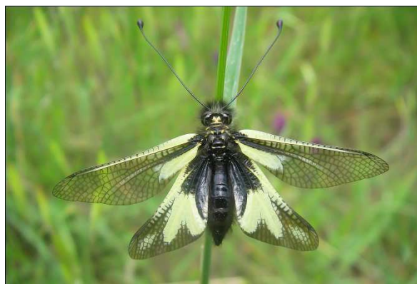
Fig. 1. Habitus of Libelloides coccajus Denis & Schiffermüller, 1775 (Ascalaphidae).