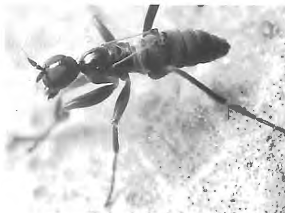
Fig. 1. Habitus male Ariasella lusitanica sp. nov. (photo by Jorge Almeida).

Abdomen brown, finely greyish pollinose;