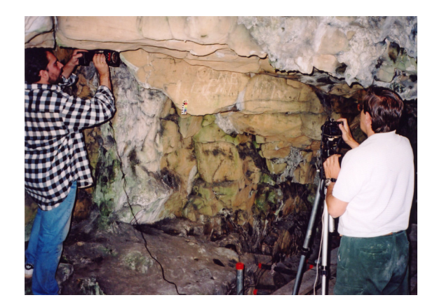
Fig. 1 — Photographing some of the engravings in Church Hole cave, Creswell Crags. Photograph: Paul Bahn. With the authorization of Sergio Ripoll (http://www.uned.es/dpto-pha/creswell/fotos.htm).

the shadow of the artist's hand obscuring his or her view, they often require lighting from the side to be seen clearly. Frontal lighting can render them quite invisible. And of course it takes considerable experience to be able to differentiate natural cracks in rock from engraved lines.