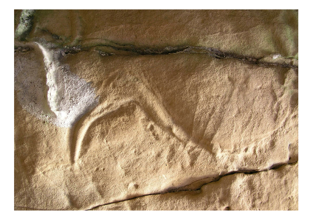
Fig. 3 - Church Hole (Creswell Crags, England): bas-relief bird on Panel IV.