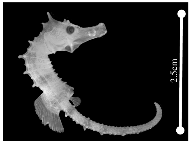
Fig. 2. – Photograph of specimen 2

of the specimens, which were preserved in a 10% formaldehyde-seawater solution, are based on characteristics described by LOURIE et al. (2).