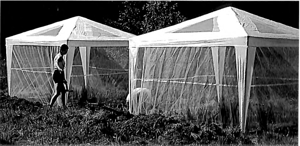
Fig. 1. – Insectary.

Four dining shelters (Partytent, marketed by Bricomarkt B.V.B.A.; size: 3x3x2.5 m), were covered with bee-netting (mesh size: 2x8 mm, marketed by B.V.B.A. Ranschaert) (Fig. 1). In contrast with former studies (FINCKE, 1987; FORBES & LEUNG, 1995) the netting allowed passage of small insects and avoids the need to supply food. To allow enough light, we replaced triangular parts of the plastic roof with the bee-netting. Insectaries were secured against heavy wind by stretching tent-ropes and by digging in the undersides of the bee-netting. The total price of an insectary was approximately 2000 BEF (65 USD) at the time of the study.