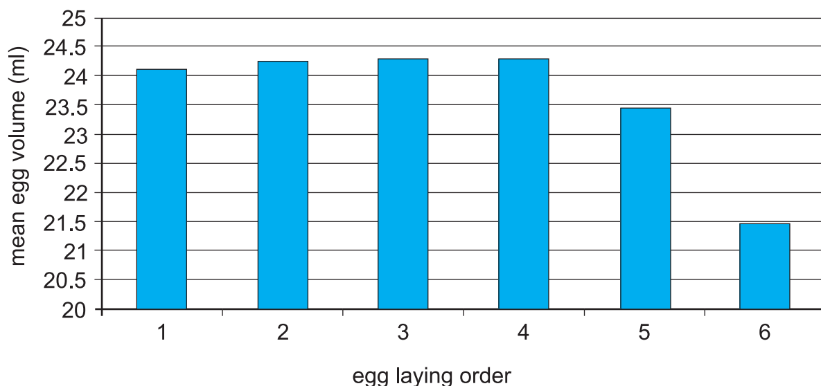
Fig. 2. – Mean egg volume vs. egg laying order.

The nests built by the harriers in the two study periods differed in size. The mean diameter of nests built in the 1990s was smaller than that of the nests in the second period (Table 2). The diameter of the nest was not related to brood size (Mann-Whitney test z=1.603 , n=78 , p=0.87 ) or clutch size, but the relationship between diameter and clutch size was near-significant (Mann-Whitney test z=1.94 , n=78 , p=0.052 ). Weather conditions in May, when most harriers started incubating were similar in both study periods. There were no differences between them with respect to the following weather parameters: maximum temperature (Mann-Whitney test z=-0.96 , n=14 ,