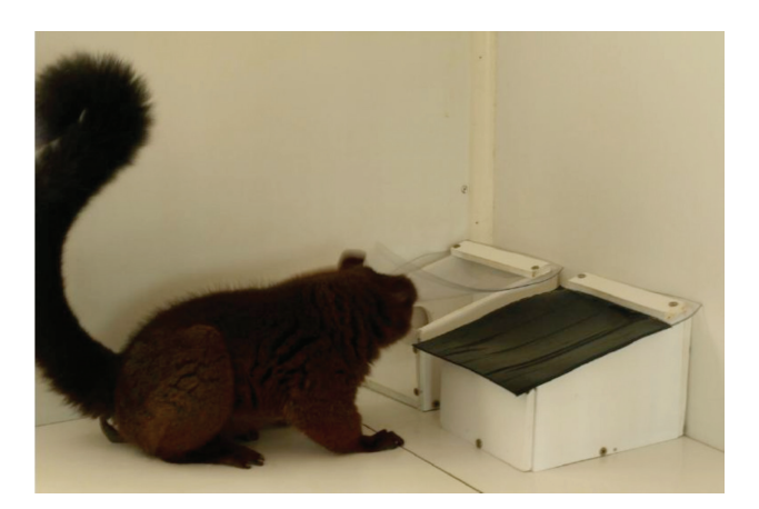
Fig. 1 -Opening of a box by a test subject. The use of an opaque versus transparent lid allowed us to test for the use of visual cues.

effect was tested in unimodal and multimodal conditions: vision, olfaction, audition, visionolfaction, vision-audition, olfaction-audition. A control experiment with all cues present was also conducted. The seven experiments are summarized in Table 1.