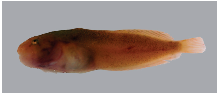
Fig. 2. – Photograph of the fresh Liparis montagui specimen caught in BPNS.

During our long-term monitoring programs, regular beam trawl samples have been taken for over 20 years on the Belgian part of the North Sea. These data showed that L. liparis is a common species throughout the area (4) while L. montagui was never observed (pers. obs.). There was uncertainty about the possible observation of L. montagui during a sampling campaign on September 24 th , 2007 (4 years prior to the reported observation), but unfortunately due to the inferior condition of the specimen we were unable to make a straightforward identification. Hence, the recording of March 9 th , 2011 is considered to be the first official reported catch of L. montagui for the Belgian marine waters. Since then, L. montagui has been reported from Belgian waters by Hans De Blauwe (12) at the marina of Zeebrugge and by Kelle Moreau (pers. comm.) at the coastal zone of Nieuwpoort, the latter caught on September 9 th , 2013 from R.V. Simon Stevin with a 6 meter shrimp beam