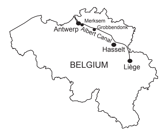
Fig. 2. – Map showing the Albert Canal in Belgium and sampling sites (Merksem and Grobbendonk).

and since, according to INBO (the Belgian Research Institute for Nature and Forests), round goby catches in fyke nets are very poor, most data come from anglers (VERREYCKEN, 2012, personal information); indeed at Grobbendonk in