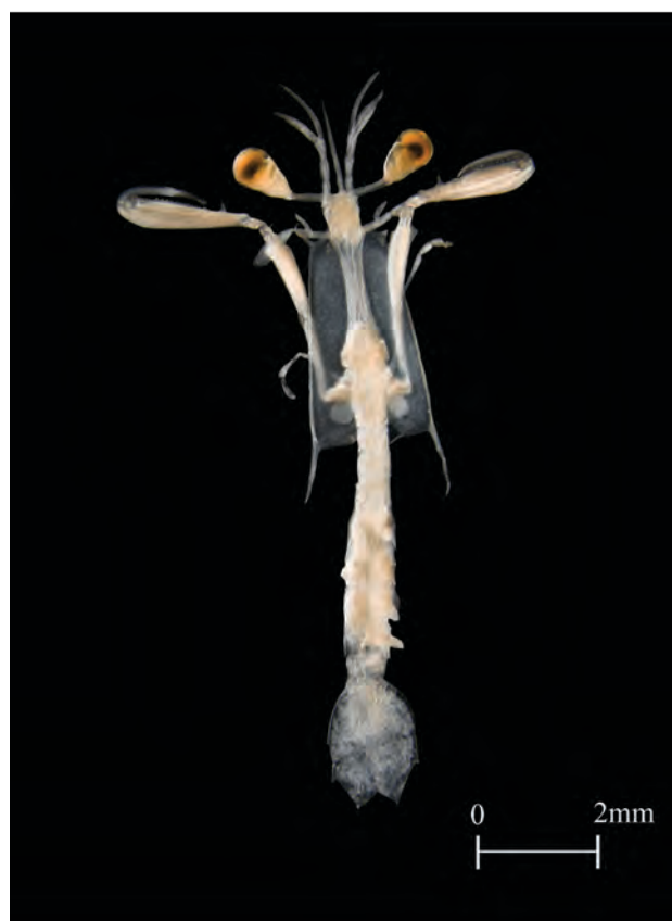
Fig. 1. – Picture of the 6 th stage megalopa larva of Rissoides desmaresti (specimen 1).

In Belgian waters, adults have so far never been recorded (12). However, Stomatopoda larvae were collected by G. Gilson during the European ICES (International Council of the Exploration of the Sea) campaigns between 1902 and 1913 (Gilson collection, largely preserved at the Royal Belgian Institute for Natural Sciences (RBINS)