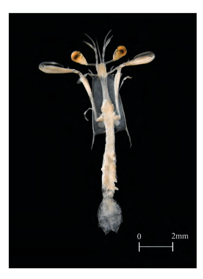
Fig. 1. – Picture of the 6<sup>th</sup> stage megalopa larva of Rissoides desmaresti (specimen 1).

In Belgian waters, adults have so far never been recorded (12). However, Stomatopoda larvae were collected by G. Gilson during the European ICES (International Council of the Exploration of the Sea) campaigns between 1902 and 1913 (Gilson collection, largely preserved at the Royal Belgian Institute for Natural Sciences (RBINS)