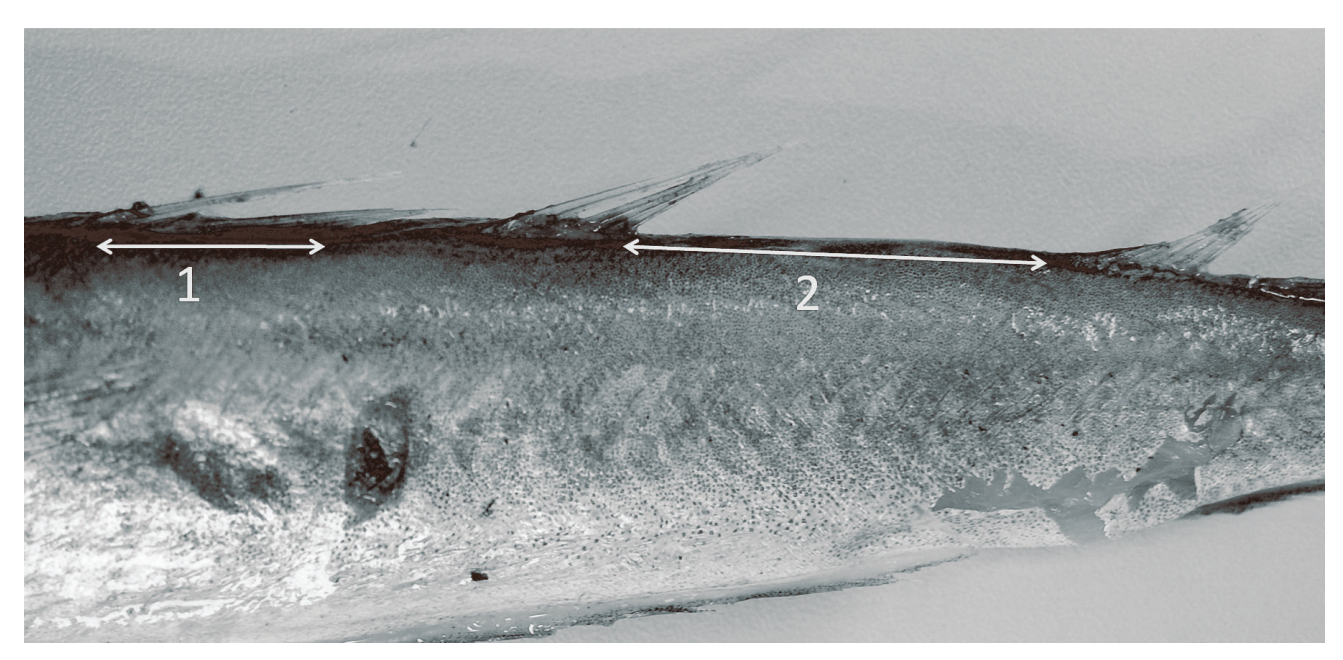
Fig. 3. – blue whiting dorsal fins are widely separated and the interspace between the second and third dorsal fin (2) is bigger than the base of the first dorsal fin (1).

Consequently, this manuscript describes the first reported sighting of blue whiting in Belgian waters, thereby adding this species to the Belgian marine species list.