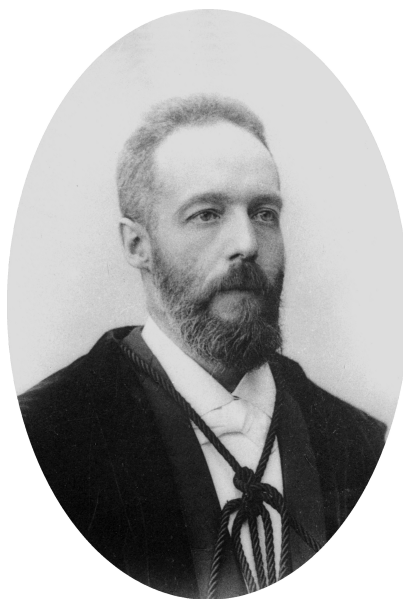
Figure 2. Maximin Lohest, photographic portrait, 1899.