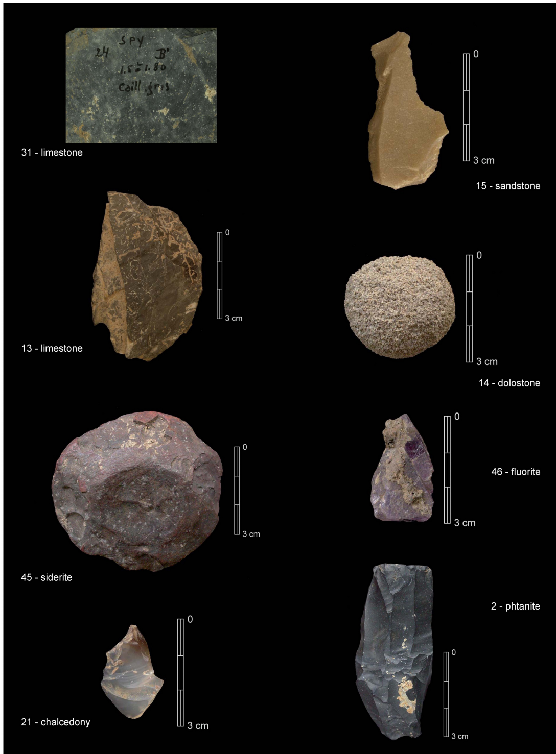
Figure 2. Studied samples of carbonate rocks, sandstone, siderite, fluorite, chalcedony, and phtanite . Numbers refer to the ST2.

immediate vicinity of the site, and the other to Cambrian phtanite , found uniquely in the area around Cérroux-Mousty. The same Raman examination of the biface from Rucquoy's excav-