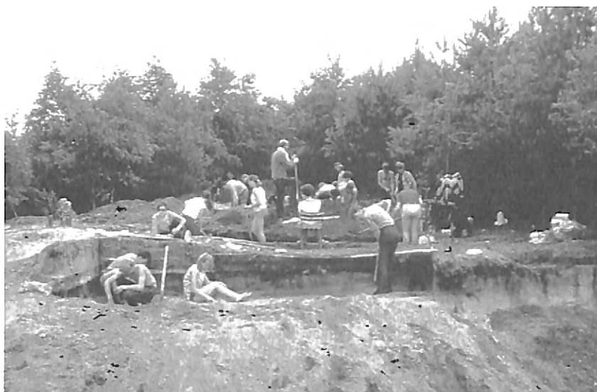
Fig. 1 — Excavation of Meer II in the 1960s.

starting date stipulated by his building permit and without taking into consideration the obligatory archaeological research. A building pit of approximately 0.5 ha was dug and completely destroyed perfectly in situ hunter-gatherer camps. The total surface of destroyed hunter-gatherer camp remains exceeds the total surface of all archaeological excavations performed at the site to date; the extent of destruction can thus not be minimised. Due to this deliberate and triple infringement on the laws relating to construction works, (protected) monuments and archaeological heritage, an important European archaeological heritage remain has been damaged.