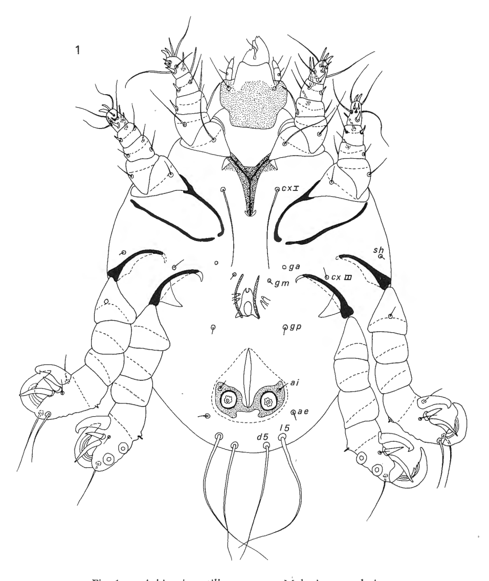
Fig. 1. -- Askinasia antillarum sp. n., Male, in ventral view.

M a l e (figs. 1-7). — Allotype 489 \mu m long and 390 \mu m wide. In 2 specimens from Florida, 438 \times 347 \mu m and 470 \times 360 \mu m. Cuticle soft, not punctate nor striated. Dorsum as in female. Venter: Epimeres as in female. Genital organ situated at the level of coxae IV, broadly conical with the apex divided into two short sclerotized rounded and inwardly curved hooks. Its length in midline 38 \mu m. Anys flanked by 2 adanal