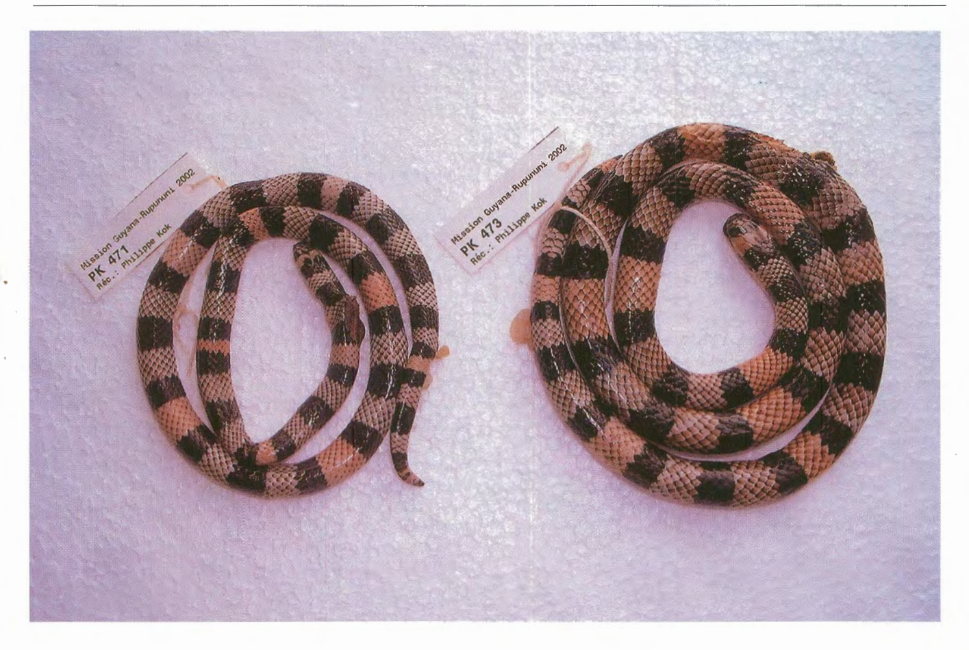
Fig. 2. Micrurus isozonus. Left, IRSNB 16573; right, ISRNB 16575.