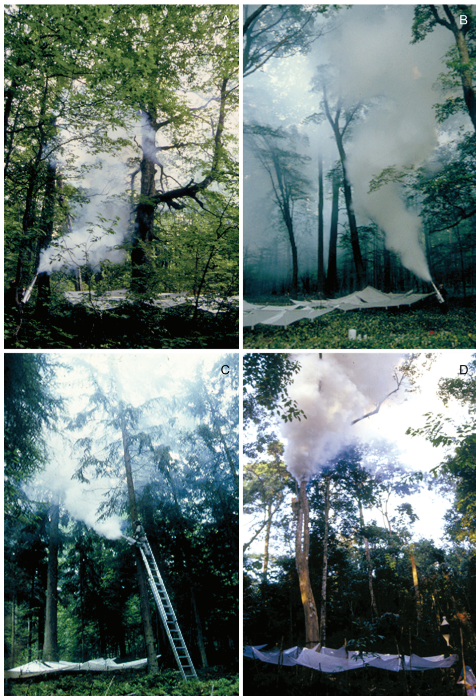
Fig. 2. Applying the fogging in the field (Photos by A. Floren).