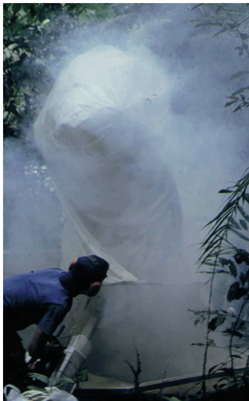
Fig. 4. Fogging a young tree by using a large cotton sac.

In temperate forests tree selectivity is achieved by simply sparing out branches from neighbouring trees and exact positioning of the collecting sheets beneath the study tree. This is quite important because species abundances often allow inferring on tree specific association (Floren & Gogala, 2002; Sprick & Floren, 2007, 2008). Guaranteeing tree specificity can be a larger problem in tropical forests, however, where several species of trees can grow within a few meters. In order to exclude collecting arthropods from different neighbouring trees or trees of the higher canopy that may partly cover the crown of the study tree, I stretched out a large cotton cloth above the study tree the day before fogging in previous studies (Floren & Linsenmair, 1997). This approach has proven very efficient but the amount of work is large. Alternatively, the search time for suitable tree species is much higher and can usually be carried out only with the help of a botanist.