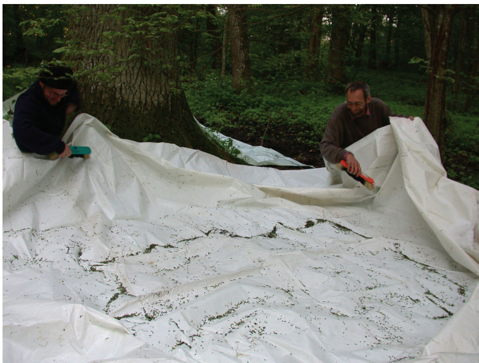
Fig. 3. Due to the high knockdown capacity of natural pyrethrum the 'insect rain' starts immediately after fogging. The fogging of this oak tree resulted in more than 40 000 arthropods.