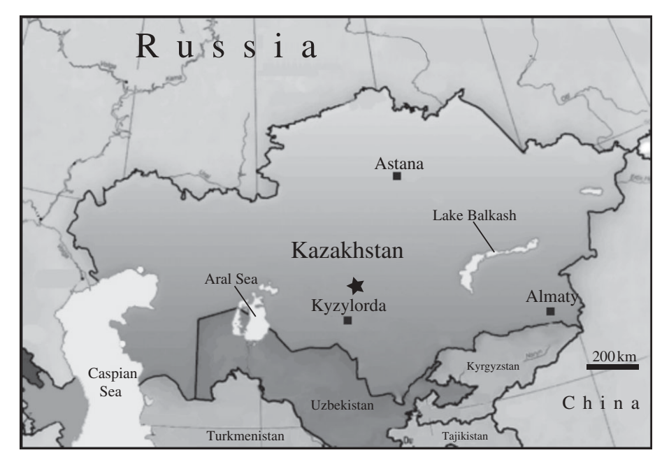
Figure 2. Map of the Republic of Kazakhstan showing the location of Akkurgan (star). Sites in southern Kazakhstan well known for yielding Cretaceous terrestrial vertebrates include the nearby Shakh-Shakh ( ca 200 km from Akkurgan) and the more southerly Kyrk-Kuduk and Syuk-Syuk. See Malakhov et al. [7] for more details.

the results indicate that Samrukia is nested deeply within Aves at the base of Ornithuromorpha ( sensu Chiappe & Witmer [9]), unresolved alongside Patagopteryx , Ichthyornis , Archaeorhynchus , the Yixianornis + Yanornis clade, Hongshanornithidae and Neornithes (figure 1). A series of derived characters, revealed by our analysis (i.e. two distinct mandibular cotyles, fusion of mandibular elements and absence of mandibular fenestrae) place Samrukia deep within Aves (figure 1) [9,10] and suggest that this taxon is not closely related to any of the modern bird lineages that evolved large size during the Cenozoic. All other known taxa within this region of the tree are relatively small (body size <2 kg and with mandibles ca 100 mm long or less) [3,9,21].