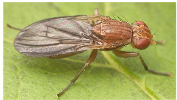
Fig 1. Pelidnoptera fuscipennis.