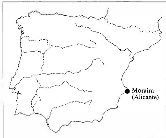
Fig. 1. Map of Spain with the indication of the position of Moraira in the province Alicante.

Material was collected by Dr. R. WAHIS at Moraira (Fig. 1; altitude: 90 m; prov. Alicante) by means of a Malaise trap placed in a garrigue where Rosmarinus officinalis and Pinus halepensis were the dominant plants. All material is conserved in alcohol in the collections of the Koninklijk Belgisch Instituut voor Natuurwetenschappen in Brussels.