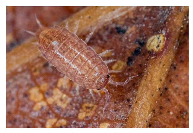
Fig. 1. Female Trichoniscus sp. from Chaudfontaine where the first T. alemannicus were collected.

Trichoniscus alemannicus is a small species of woodlouse reaching up to 3.7mm for males and 4.5mm for females (GRUNER, 1966). With this length the species is in the middle of the length of T. provisorius (reaching about 3.5mm when fully grown) and T. pusillus (generally up to 5mm) (VANDEL, 1960; GREGORY, 2009). Like the other two species T. alemannicus has a mottled purplish colour, a smooth body surface and eyes composed of three ocelli. Females pose no features to distinguish between the different species (Fig. 1). The species can only reliable be identified by microscopic examination of the male exopod. T. pusillus (Fig. 2A) and T. provisorius (Fig. 2B) can be easily distinguished by the lump at the outside of the exopod of T. provisorius. There is some