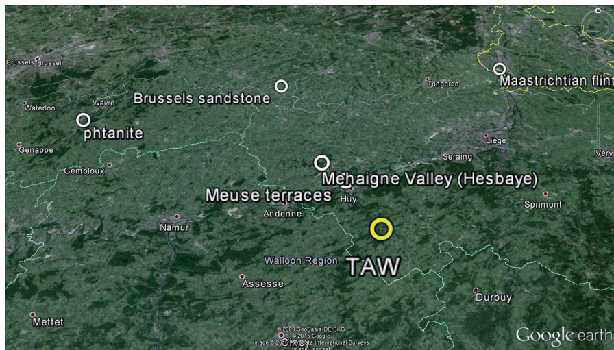
Fig. 2 – Map showing Trou Al'Wesse and general locations of the lithic sources exploited Google Earth courtesy.

the Ottignies-Mousty region. Brussels sandstone (glazed sandstone or grès lustré ; type 10) has been identified for two fairly large flakes and four core preparation flakes, and comes from the Landen region about 45 km to the north. It should be noted that small chunks of chert are common in both Mousterian layers, but do not appear to have been knapped. Most of the artifacts have fresh edges and ridges and are not worn or crushed.