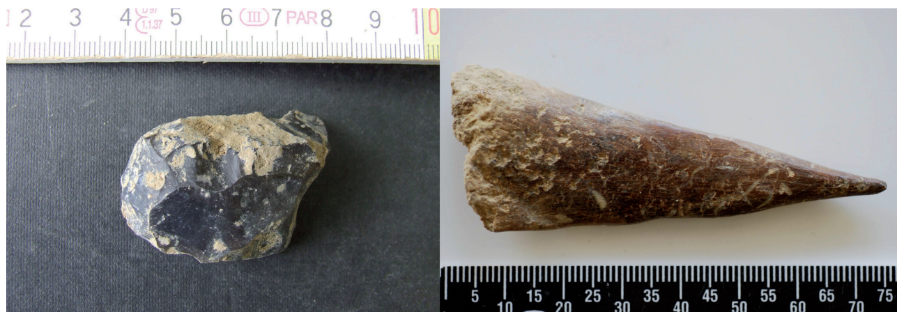
Fig. 3 – Trou Al'Wesse, Aurignacian. Left: composite tool, carinated endscrapper/carinated burin (N4.37). Right: bone point fragment (N5.67; see also Miller et al., 2007 : 46, fig. 3).

The Aurignacian lithic assemblages on the terrace are much less abundant than those in the Mousterian layers, but include bladelets, reduction flakes and small debris. In addition to these smaller sized artifacts, a larger composite tool on a thick flake (carinated endscrapper/carinated burin) and a bone point fragment were found in the upper concentration (layer 15.5; Fig. 3). In 2015, in test pit TP2013, below 19 th century backfill (from Dupont's 1860s trench) and adjacent to the eastern wall of Fraipont's 1885-87 tunnel, intact (i.e., previously unexcavated) Pleistocene deposits were found. An Aurignacian endscrapper on a long, thick blade was discovered in these deposits (Fig. 4). These observations and the preliminary geological interpretation of the depositional processes operating at Trou Al'Wesse would suggest that the smaller artifacts found on the terrace had been washed out from inside the cave while the deposits remaining in the cave could contain larger artifacts.