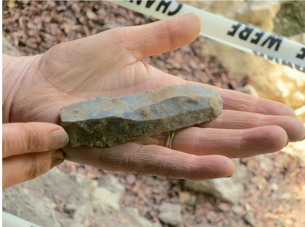
Fig. 4 – Trou Al’Wesse, TP2013. Aurignacian endscraper on blade.