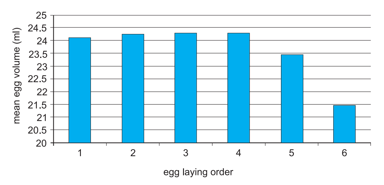
Fig. 2. – Mean egg volume vs. egg laying order.