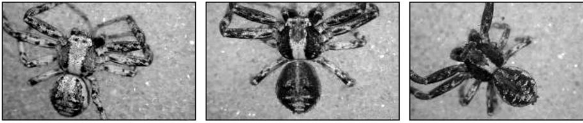
Fig. 1. – A light (left), intermediate (middle) and dark (right) coloured individual Xysticus sabulosus . Carapax colouration scores (mean \pm SD) : 136.44 \pm 37.89 , 95.33 \pm 35.13 and 60.38 \pm 37.74 , respectively.