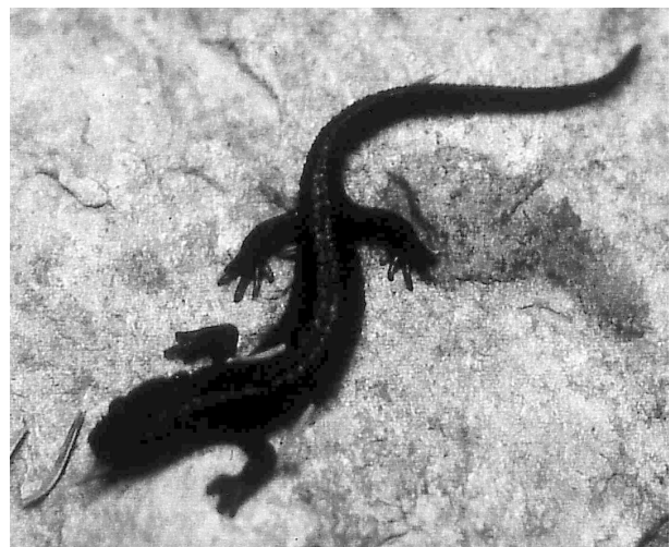
Fig.1. – Black-and-white photographs of two males of the Pyrenean salamander Euproctus asper from the Salto del Pis river, Central Pyrenees. The specimen on the left has a grey body with a contrasting yellowish dorsal band. The specimen on the right shows melanism with a entirely black body.

For the morphometric measurements 85 Euproctus asper with total lengths between 87.2 and 116.6 mm were captured by hand at the two sites. Forty seven specimens from the Flumen river consisting of 25 males and 22 females, and 38 specimens from the Salto del Pis torrent consisting of 20 males and 18 females were measured immediately after capture, and then released at the collecting sites. This method did not cause any observable harm to the animals. In the Flumen river, all specimens were collected at one date, whereas two visits to the Salto