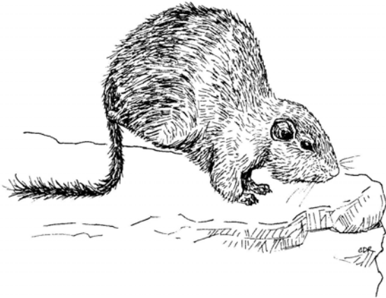
Fig. 3. – Adult female noki performing a "tail stand." Drawing based on a photograph of a free-ranging female at a basking site.

on flat basking sites and entailed standing on the front feet and propping up the hindquarters with the downturned and stiffened tail while vigorously kneading or scratching the abdomen simultaneously with both rear feet. Each "tail stand" lasted about 10 seconds. We suspect this behaviour may be related to their feeding habits (see discussion).