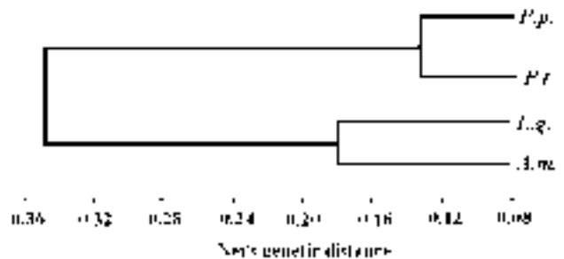
Fig. 1. – The UPGMA-dendrogram representing the relationships of 4 of the species studied, based on the Nei's genetic distances ( P.p. : Podarcis peloponnesiaca , P.t. : Podarcis taurica , L.g. : Lacerta graeca , A.m. : Algyroides moreoticus ).

In the second case seven of the eight presumptive loci analyzed were polymorphic (Table 3). The Mpi-1 locus in P. milensis was found monomorphic for the same 'a' allele as in the other Podarcis taxa examined. The mean value of the fixation index F_{(ST)}=0.646 implies that 64.6% of the total genetic variability observed was due to interspecific differences, while the remaining 35.4% was due to intraspecific ones. The values of the Nei's genetic distances between the taxa examined ranged from 0.025 to 0.484, while those of Roger's genetic identity ranged from 0.582 to 0.898 (Table 4). The UPGMA-dendrogram expressing the relationships between the 5 species studied is shown in Fig.2. This dendrogram clearly indicates that P. milensis and P. taurica are the most closely related species and P. peloponnesiaca is the next most related one