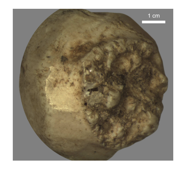
SF5. Spy cave (Aurignacian). Bead of drop-like shape (A); The expansion hole on the flattened end (B)